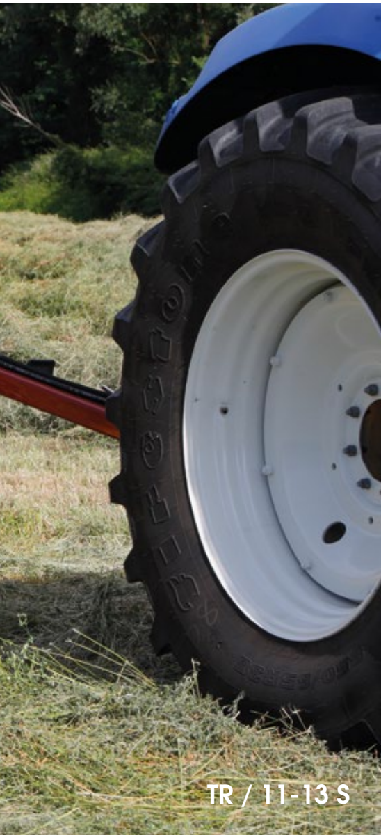
TR / 11-13 S