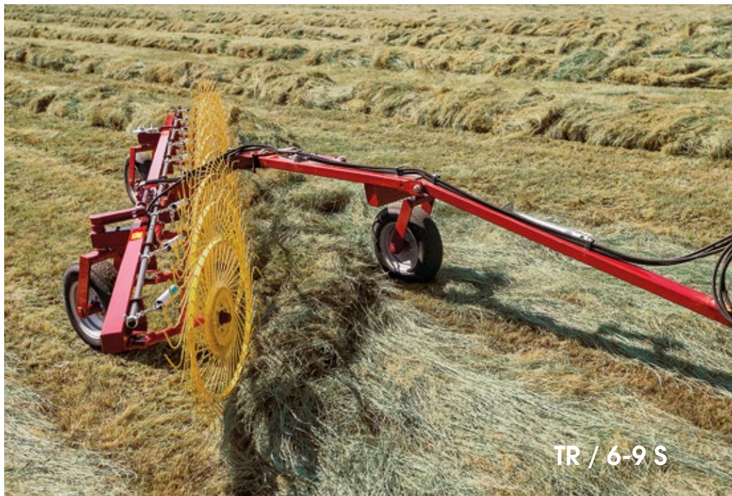
TR / 6-9 S

The machine can be brought from the transport position to the working position (and vice versa) by simply moving a hydraulic control from the tractor cab. This is because the machine is equipped with a joint system that makes it possible to minimize the overall dimensions of the machine during transport and to be able to constantly adjust the working width, adapting it to your needs. Block valves on the opening and closing cylinders allow you to transport the machine safely and to maintain the same working width while raking. A spring on each rake arm enables the rake wheels to adapt to even the most uneven terrain at all times, thus always guaranteeing top raking performance. This system also protects the machine against the stress that would otherwise be transmitted by the rake wheels while working and especially if they strike some obstacle. These features make it possible to obtain performance of the highest quality from every point of view.