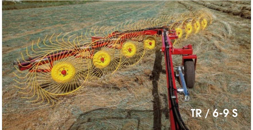
TR / 6-9 S