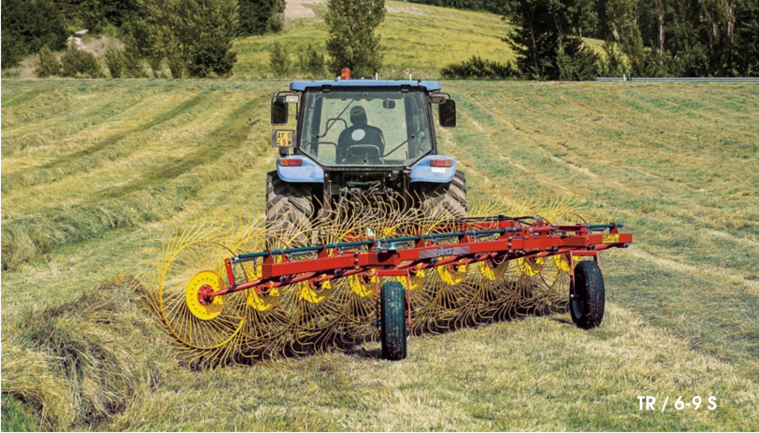
TR / 6-9 S